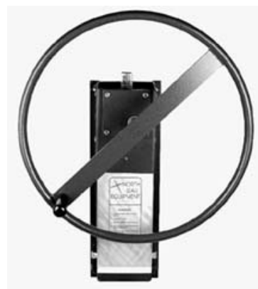
Big Blue Extruder

Over 100 stock dies available individually and in sets. Any single Big Blue die is $29.50 solid, $34.75 hollow. Custom dies from $47.50. See us for an order form.