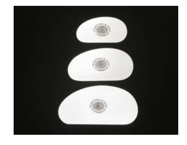
SS-4 / SS-2 / SS-H015