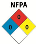
National Fire Protection Association (U.S.A.)